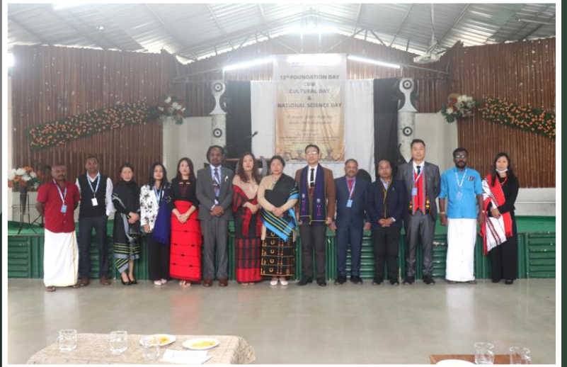
> Foundation Day