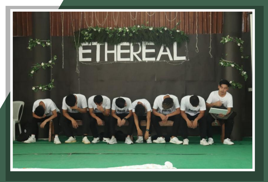
> Parting Social