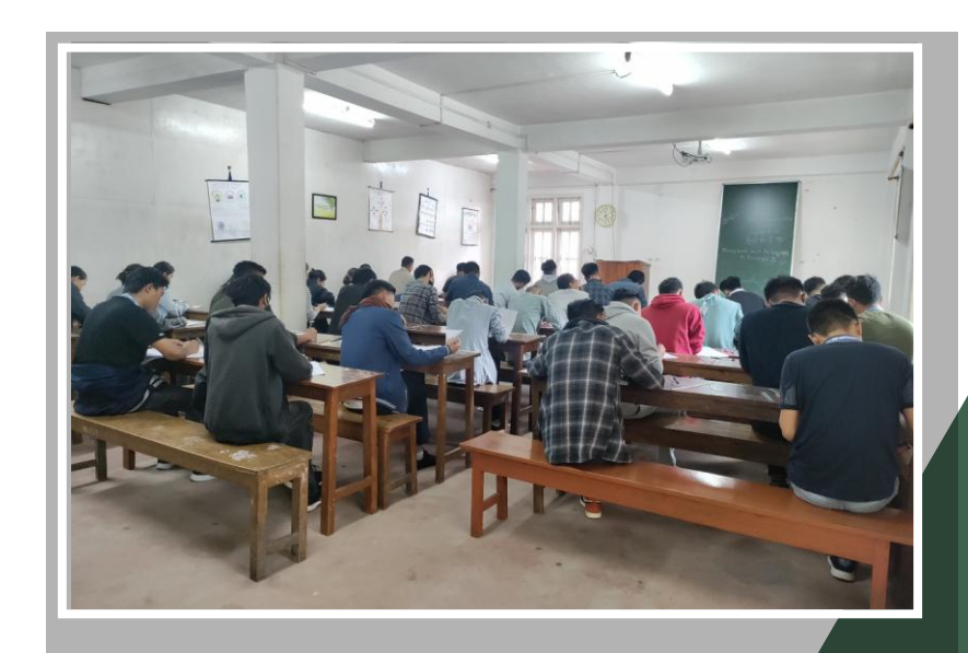
> Semester End Examination