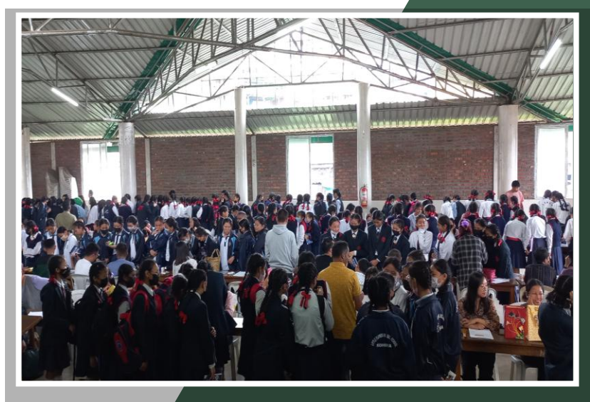
> Sci - Maths Exhibition