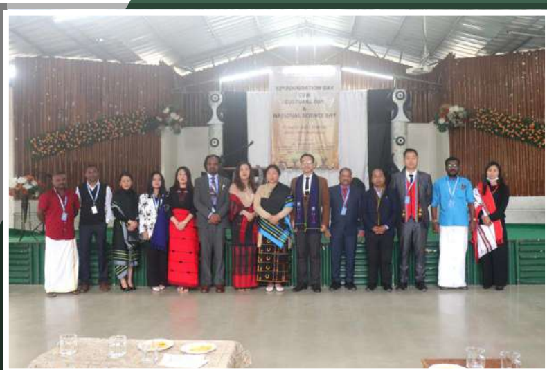
› Foundation Day