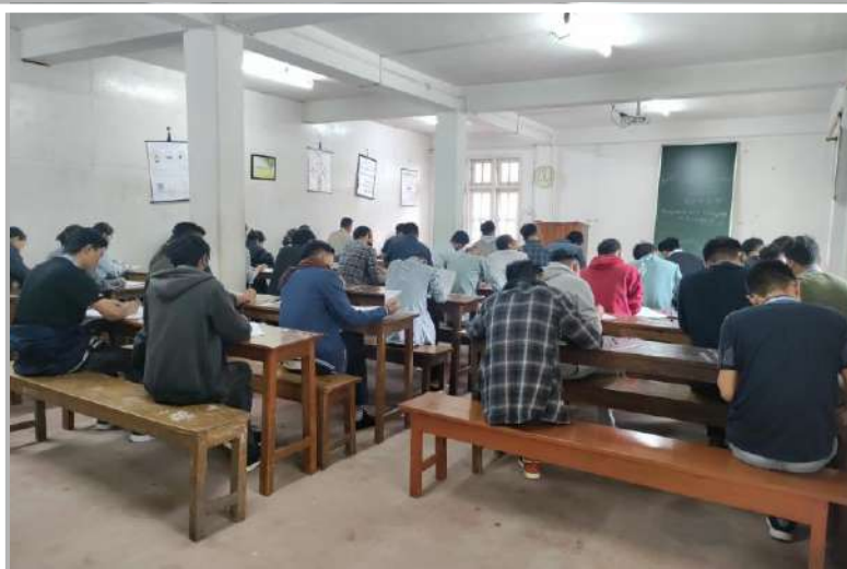
➤ Semester End Examination