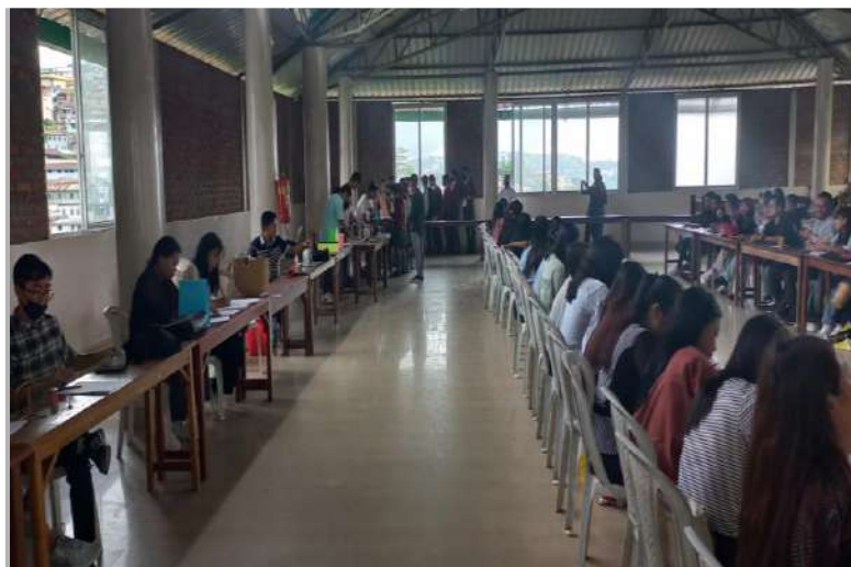
➤ Sci – Maths Exhibition