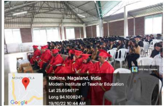
› Graduation Day