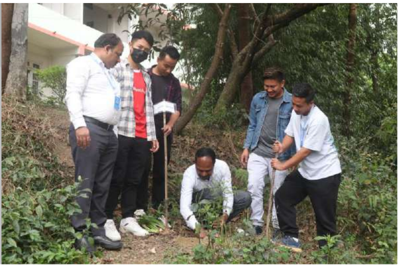
➤ World Earth Day