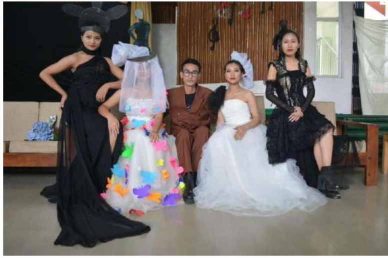
➤ Theatre Play