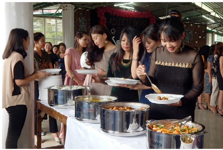
> Parting Social