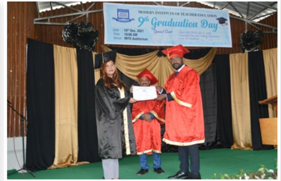
➤ Graduation Day