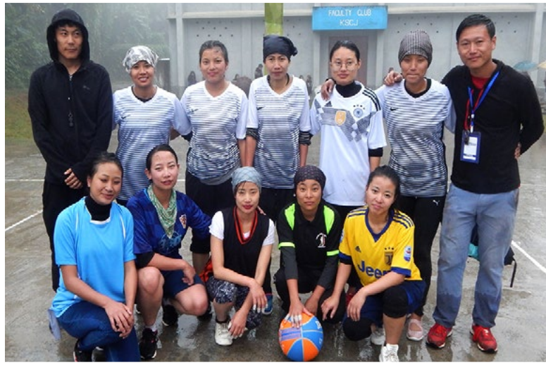
> Sports Week