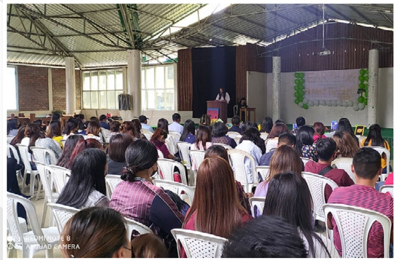
› World Earth Day