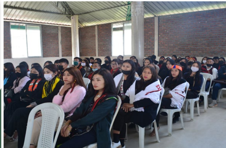
➤ Foundation Day