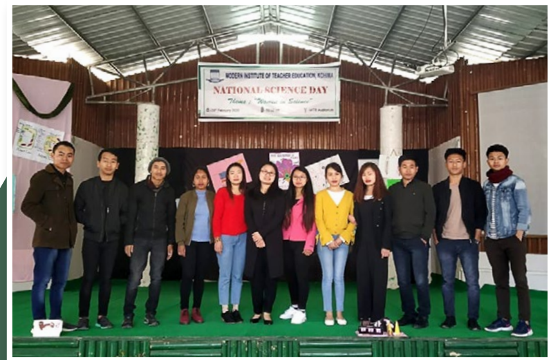
> National Science Day