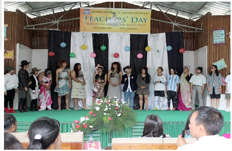
› Teachers' Day