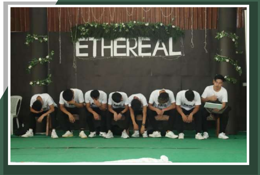
> Parting Social