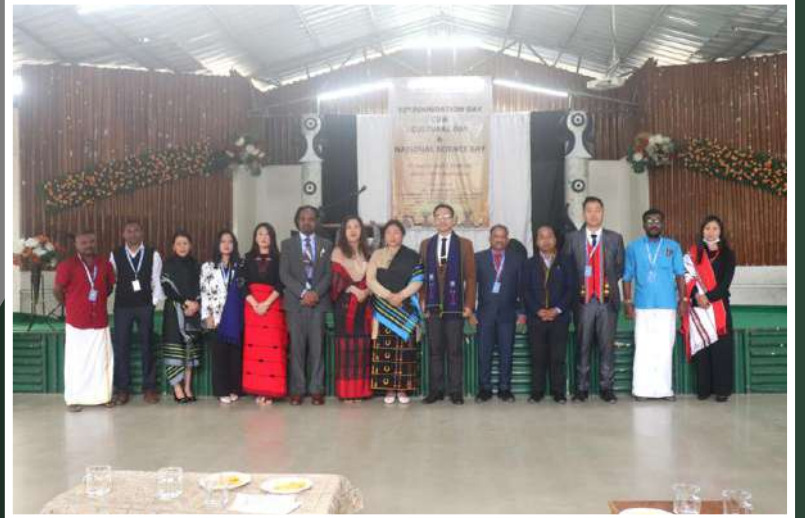
> Foundation Day