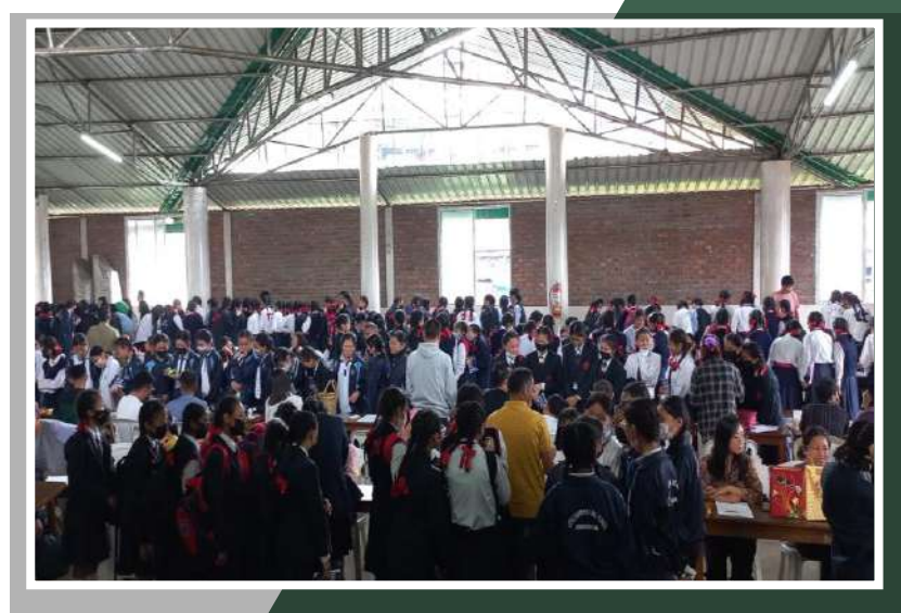
> Sci - Maths Exhibition